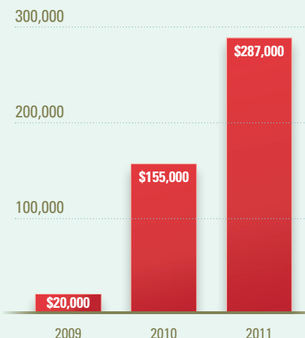
Kick-It Continues To Increase Funds For Cancer Research Every Year