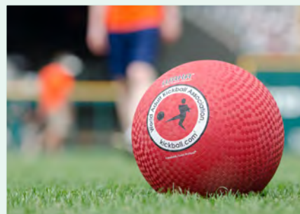
The World Adult Kickball Association (WAKA) donated 1,000 kickballs for Kick-It games across the country.